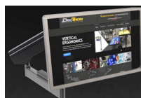
Figure 2: Monitor Mounts