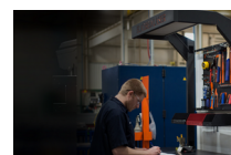
Figure 3: Ergonomic Work Stations

Culture Partners helps their business clients create an adaptive business culture that aligns with their purpose and drives results. Culture Partners has a tried-and-true, long-term approach to help businesses become more cohesive and achieve extraordinary outcomes. They work within many business sectors, including the public sector. Their proficiency in aligning organizational culture with strategic goals provides distinct advantages to public organizations, boosting efficiency, accountability, and the quality of service delivery.